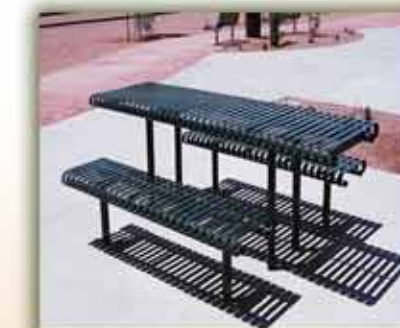
Picnic Table 1