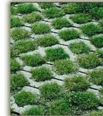
Permeable Pavers 2