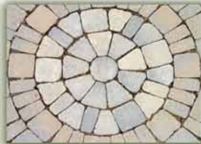
Brick Pavers 4