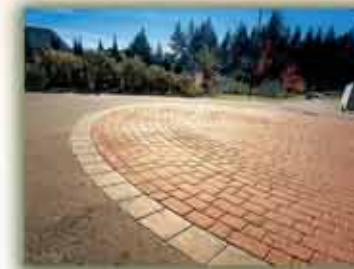
Colored Asphalt 1