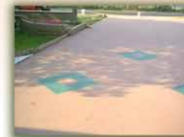
Colored Asphalt 2