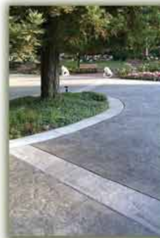
Stamped Concrete 3