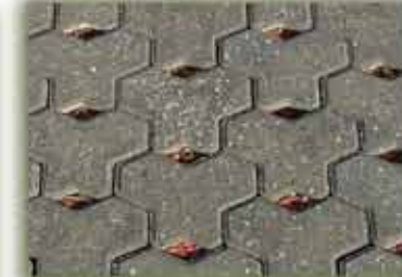
Permeable Pavers 1