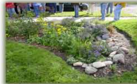
Rain Garden 1