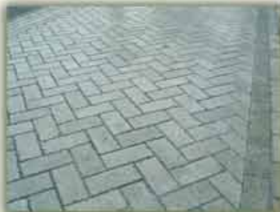
Brick Pavers 2