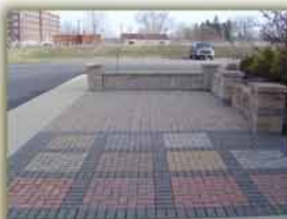
Brick Pavers 3