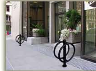
Bike Rack 1