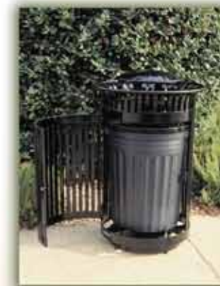
Trash Receptacle 1