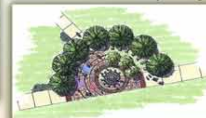
Trail Wayside 1