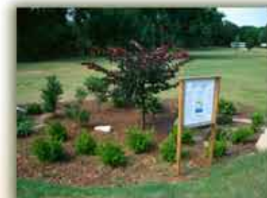
Rain Garden 2