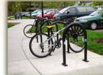
Bike Rack 2