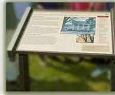
Trail Interpretation Signage 1