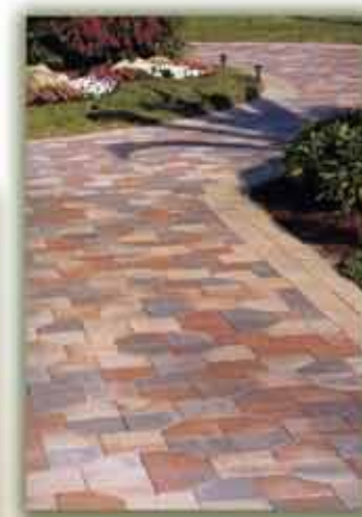
Brick Pavers 5