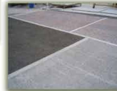
Pervious Pavement 1