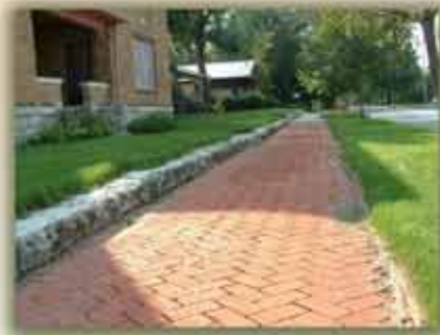
Brick Pavers 1