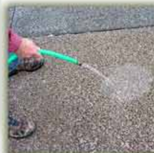
Permeable Concrete 1