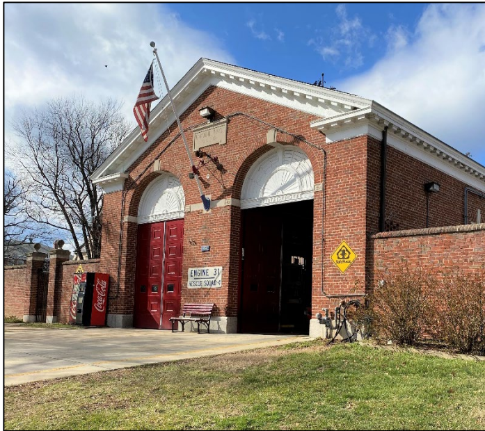
Engine Company 31.

Section 106 of the National Historic Preservation Act (NHPA) of 1966 (16 US Code [USC] 470; 36 Code of Federal Regulations [CFR] 60, 63, 800) requires federal agencies to coordinate with the State Historic Preservation Officer (SHPO) and other consulting parties and consider the effects of a proposed federal action on cultural resources listed in, or are eligible for inclusion in, the NRHP. As a DC government agency, DDOT must also follow Section 9B of the Historic Landmark and Historic District Protection Act of 1978 (DC Law 2-144) and take into consideration potential adverse effects to resources listed in or eligible for listing in the DC Inventory of Historic Sites and ways to avoid, minimize, and mitigation those advise effects.