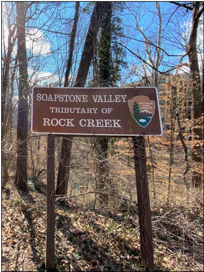
Soapstone Branch signage (with back of apartments on Connecticut Avenue NW visible).