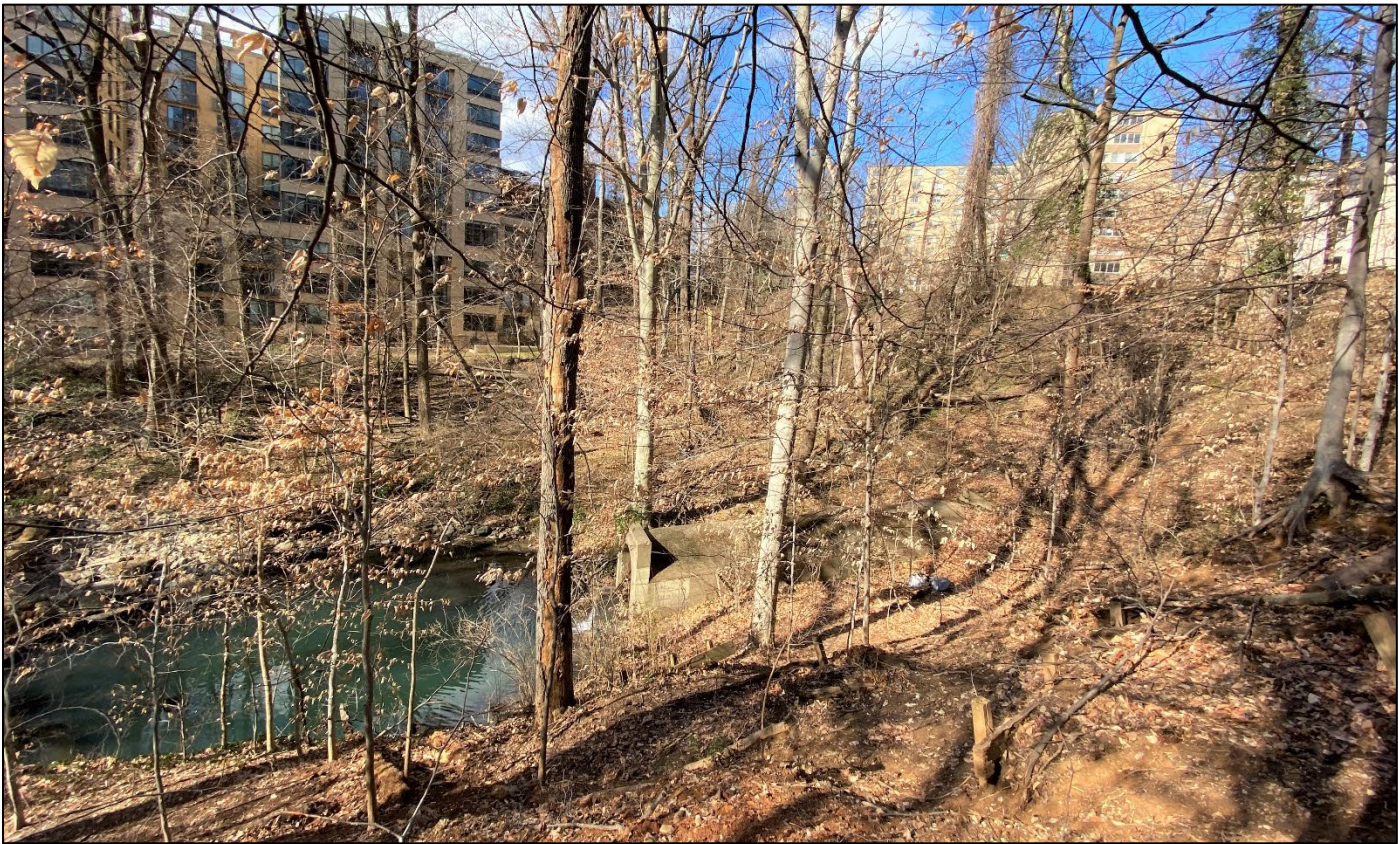
Soapstone Branch, east side of Connecticut Avenue NW (facing towards roadway).