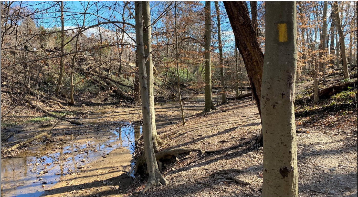
Melvin Hazen Valley Branch, west side of Connecticut Avenue NW (facing away from roadway).

The U.S. Environmental Protection Agency (EPA) lists both Rock Creek and Broad Branch as impaired waters for multiple uses: recreation; aesthetic; protection and propagation of fish, shellfish, and wildlife; and protection of human health related to consumption of fish and shellfish. The causes of impairment for these waters include metals (including mercury), pathogens, pesticides, polychlorinated biphenyls (PCBs), turbidity, and pH, with probable sources listed as typical urban-related runoff, stormwater, and municipal discharges (sewage).