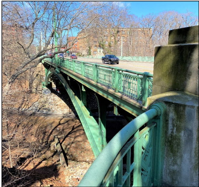
Klinge Valley Bridge.