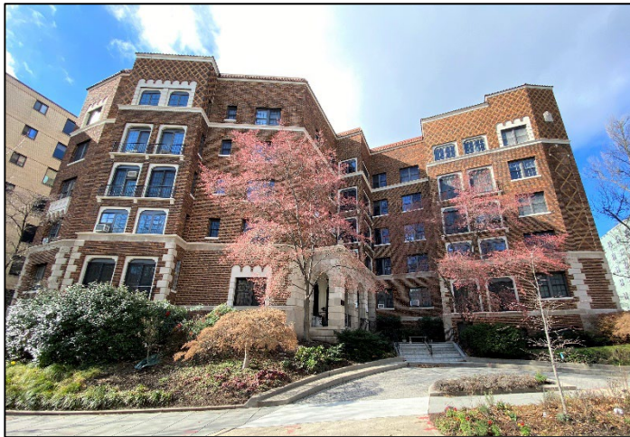
The Ponce De Leon.