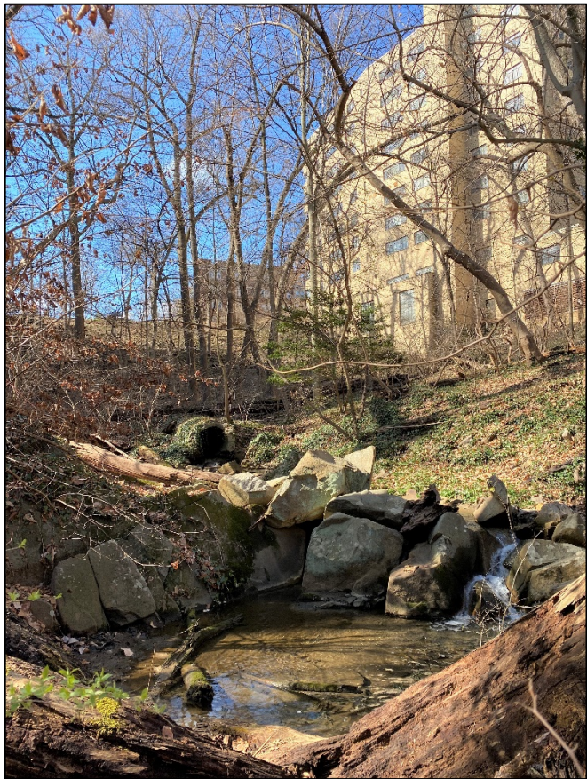
Melvin Hazen Valley Branch, east side of Connecticut Avenue NW (facing towards roadway).