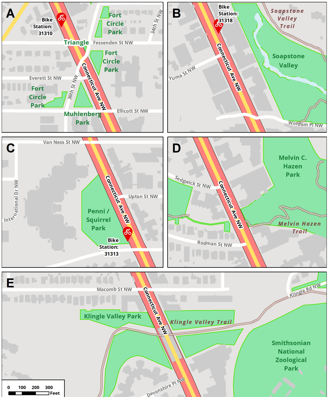
Figure 4b | Parks and Recreational Facilities – Details