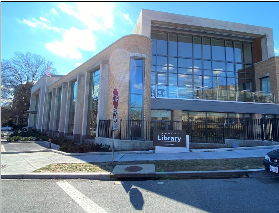
Cleveland Park Library on Connecticut Avenue NW (at Macomb Street NW).