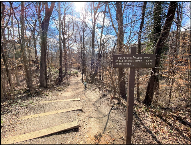
Soapstone Valley Trail (entrance from Albemarle Street NW).