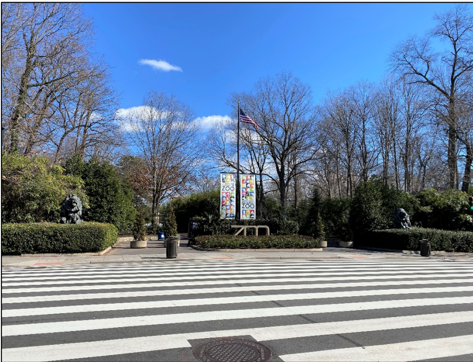
Entrance to the National Zoo.