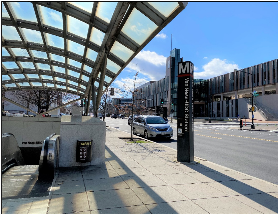
Van Ness-UDC Metrorail Station.