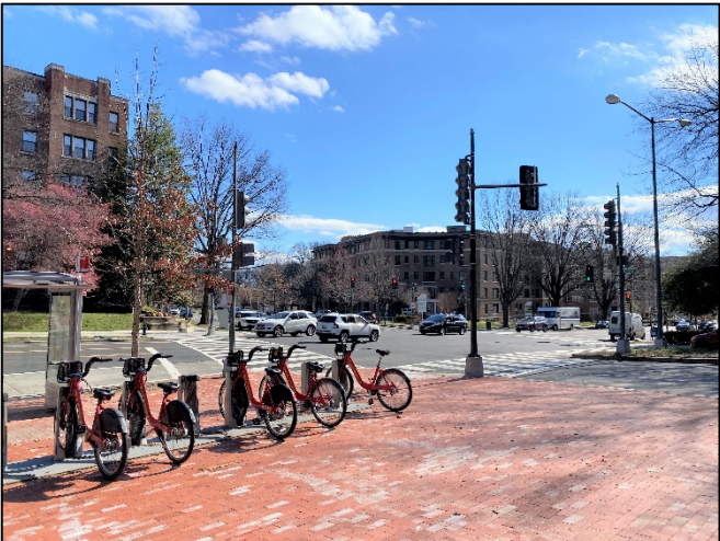
Typical Capital Bikeshare Station on Connecticut Avenue NW.