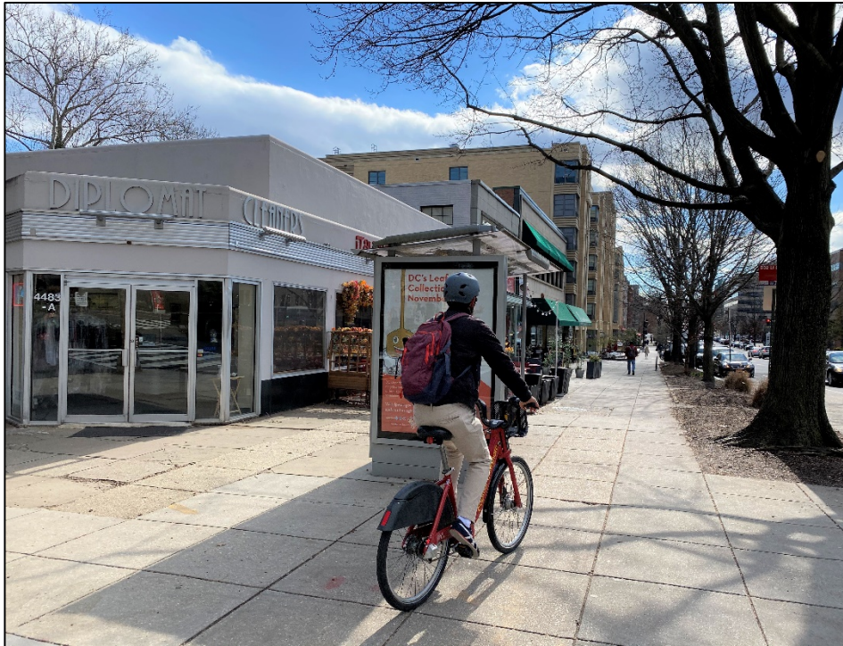
Connecticut Avenue NW near Albemarle Street NW (looking south).