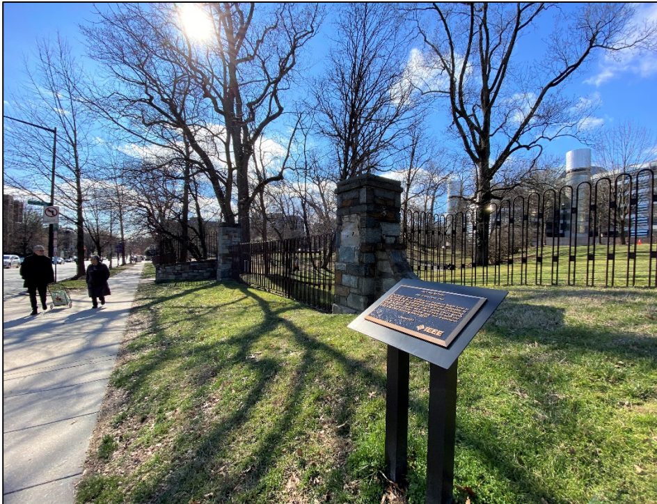
Penni/Squirrel Park in front of Intelsat Headquarters (near Tilden Street NW).