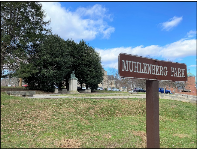
Muhlenberg Park/Muhlenberg Memorial.