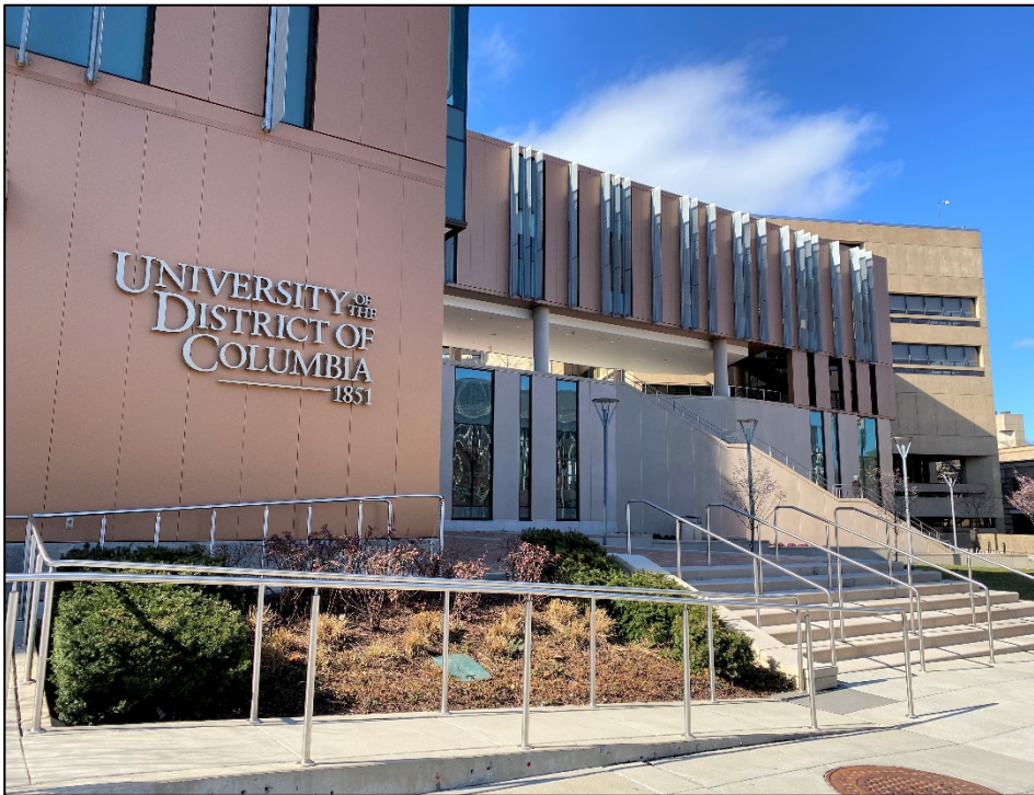
UDC on Connecticut Avenue NW.