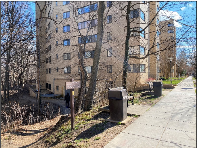
Entrance to Melvin Hazen Trail at 3700 Connecticut Avenue NW.

Section 4(f) of the US Department of Transportation (USDOT) Act of 1966 (49 USC 303; 23 CFR 774) protects publicly owned parks, recreational areas, wildlife and waterfowl refuges, or public and private historic sites. There are no wildlife and waterfowl refuges in the primary study area. Historic properties are discussed in Section 2.5. Section 6(f) refers to the Land and Water Conservation Fund (LWCF) Program, which was established in 1965 by the federal government to expand public, outdoor recreation space. Section 6(f) provides matching funds in the form of grants to states or municipalities for acquisition, planning, or improvements to public outdoor recreation space. Based on review of LWCF fund grants in the District, none of the parks or recreational facilities in the study area received such funding.