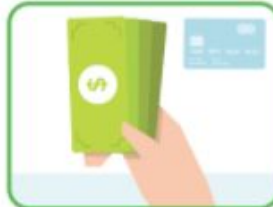
Pay with cash or credit card