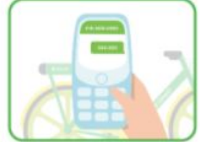
Unlock bike or scooter via text or through the Lime app