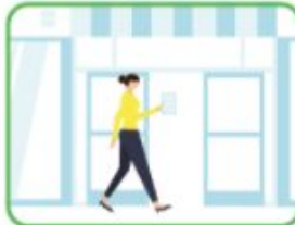
Take barcode to any PayNearMe partner store