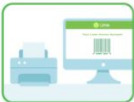
Print personal account barcode