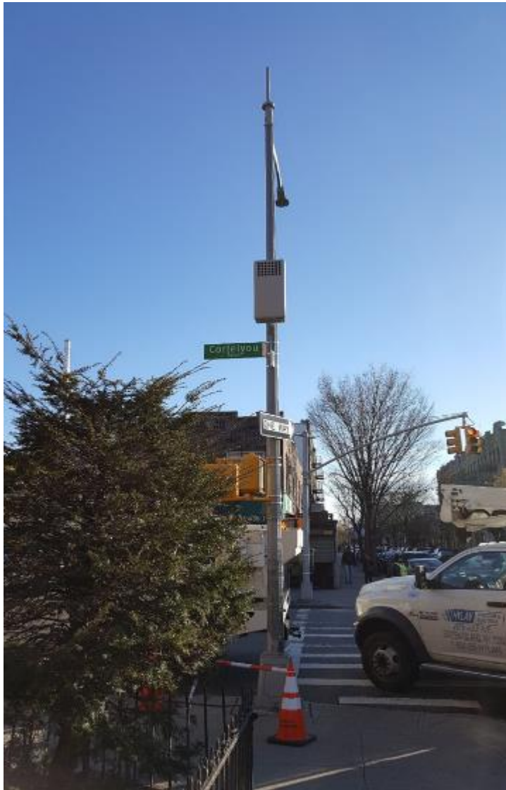
New York City, NY