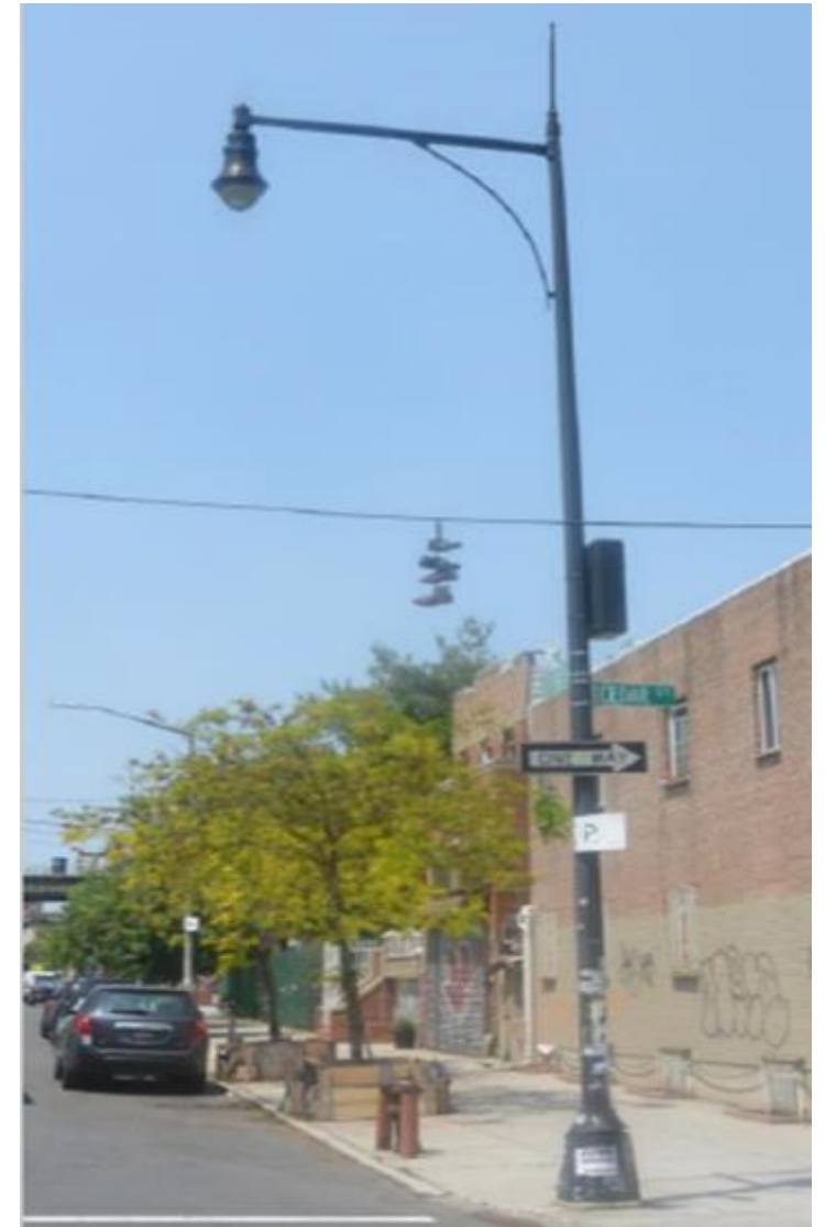
Los Angeles, CA