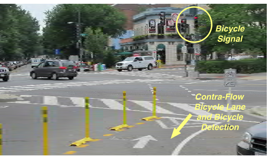
SOUTHBOUND APPROACH ON NEW HAMPSHIRE AVENUE

H:\projfile\11404 - DDOT Innovative Bike Facility Evaluation\dwgs\figs\11404_fig01.dwg