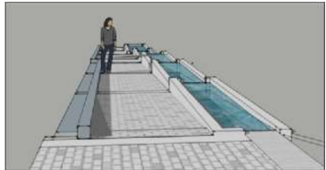
Concept Design for Pedestrian Alley

The goal of the Q St Green Alley project is to build a pedestrian-friendly alley using stormwater management techniques such as permeable paving and stormwater planters. The project was awarded Transportation Enhancement Funds following an application by the local community group, Friends of Hardy Recreation Center. One half of the alley will be converted to pedestrian-only use to improve the connection between the surrounding neighborhood and the recreation center. The other half will remain open to vehicle traffic. Stormwater flows that enter the alley from surrounding roads and alleys will be captured in permeable pavement and stormwater planters to reduce volume flowing into sewers and streams.